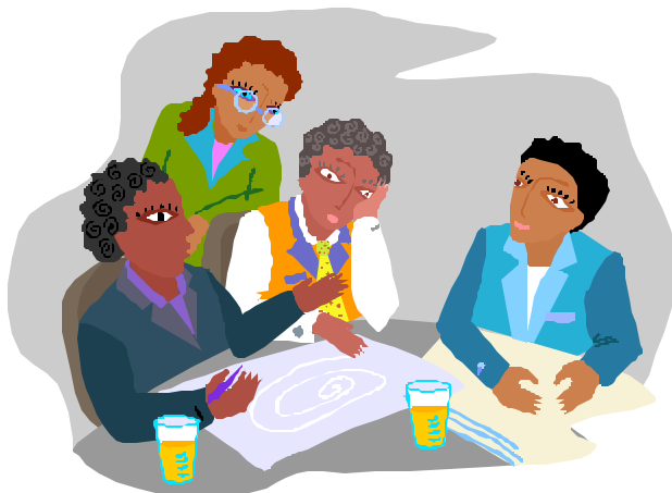
Thry'vors welcomes a new slate of officers

This is the second in a series of seasonal newsletters, from the Canadian Thyroid Cancer Support Group (Thry'vors) Inc. Your comments and suggestions are most welcome. Please direct your comments to the Listserv Committee Chair, at thryvors@sympatico.ca