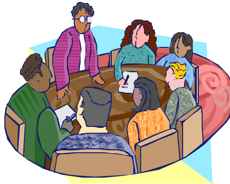
The AGM was held at Wellspring in Oakville

On May 1, 2004 the Canadian Thyroid Cancer Support Group (Thy'vors) Inc. held its third Annual General Meeting at Wellspring, Oakville, Ontario. It was a wonderful opportunity to take care of some important business items while meeting with some of Thy'vors members – some being with us from when we started as an organization, and some brand new (one just called us for the first time that same morning!). We brought together members from various parts of Southern Ontario and had one member communicate by conference call from Nova Scotia as well.